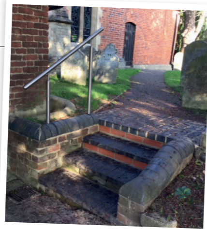
A new hand-rail next to the steps by the church porch.